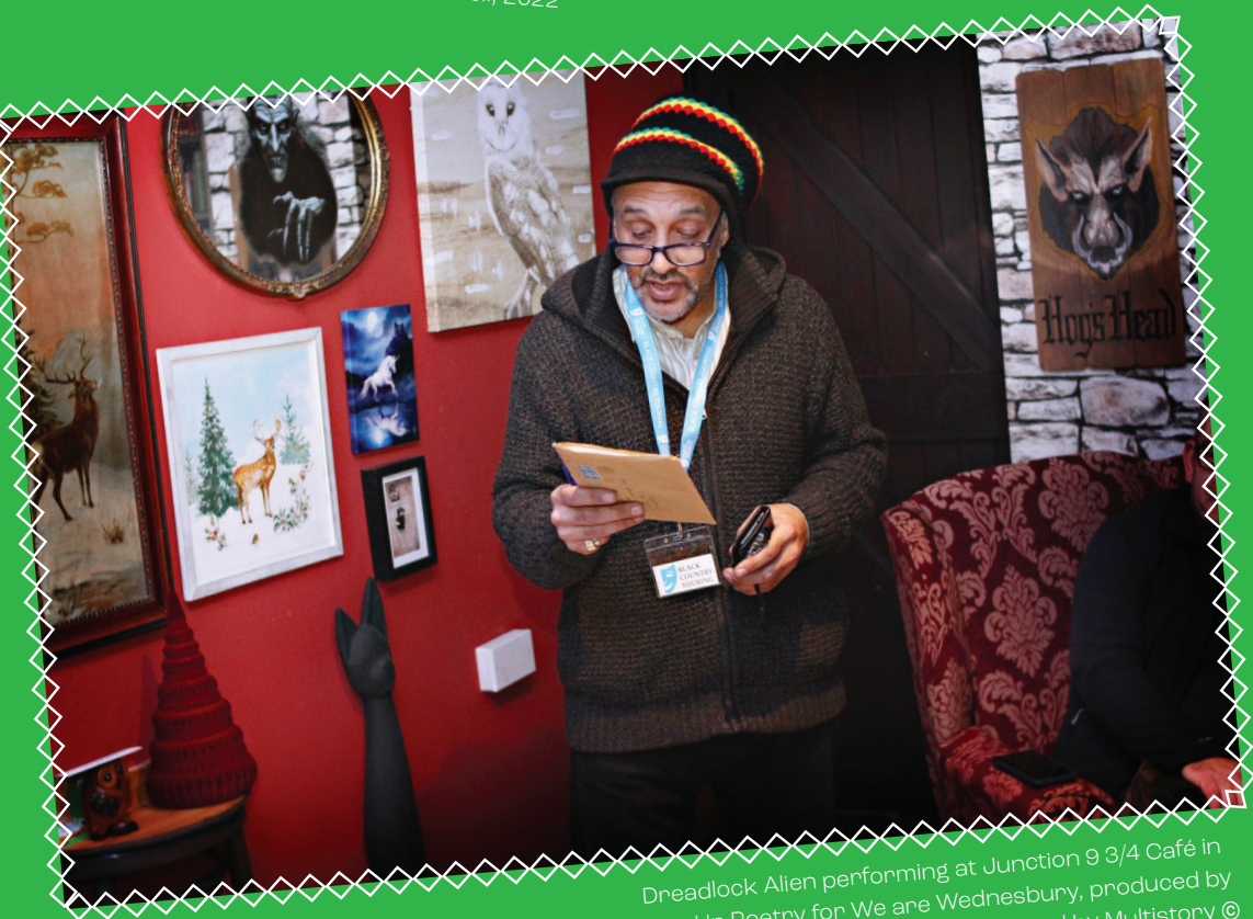
Pop-Up Poetry for We are Wednesbury, produced by